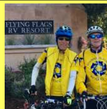
Two swashbucklers wearing snappy club jerseys.

Contact Dan Mathews to buy your Yellow Pedal Power.