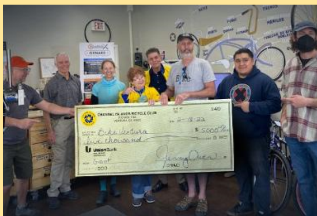
In February, CIBike board members awarded the grant check to the staff at the Oxnard Bike HUB.

In addition to these two grants, the club supported the following advocacy organizations.