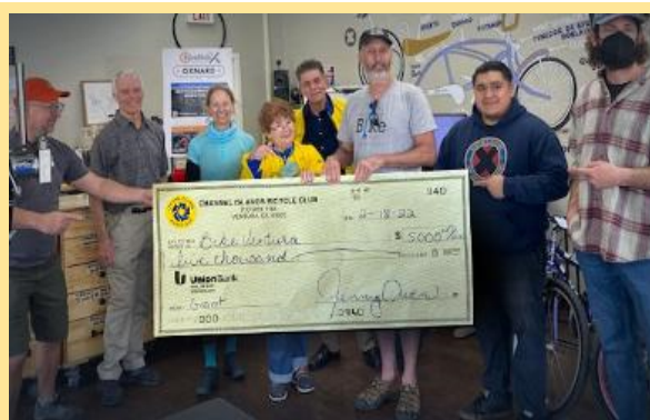
CIBike Directors present grant check to BikeVentura Oxnard HUB.