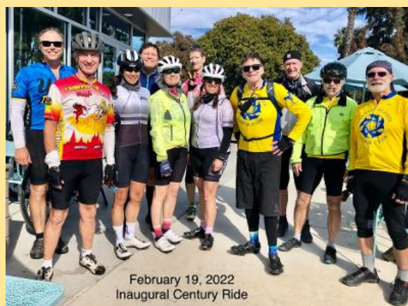
February 19, 2022 Inaugural Century Ride