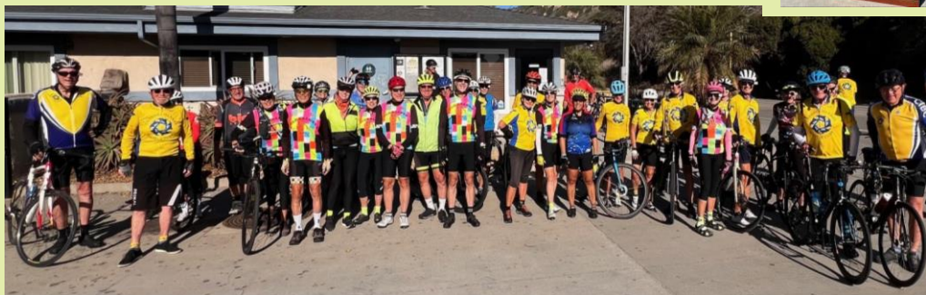
The crowd grows en route to the ribbon cutting.