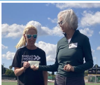
The Thousand Oaks Adaptive PE class was the recipient of a CIBike grant.