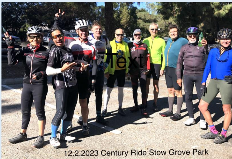
12.2.2023 Century Ride Stow Grove Park

The 100-mile rides had between 10 to 15 member-riders each time. The rides included SAG support at designated rest / refueling stops. We also tried to schedule two, 62 mile (metric century) rides each month allowing Year Rounder participants opportunities to complete their monthly goal.