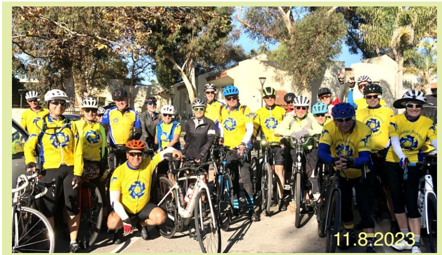
CIBike members get ready to ride to the November 8 opening of the Carpinteria Bikeway.